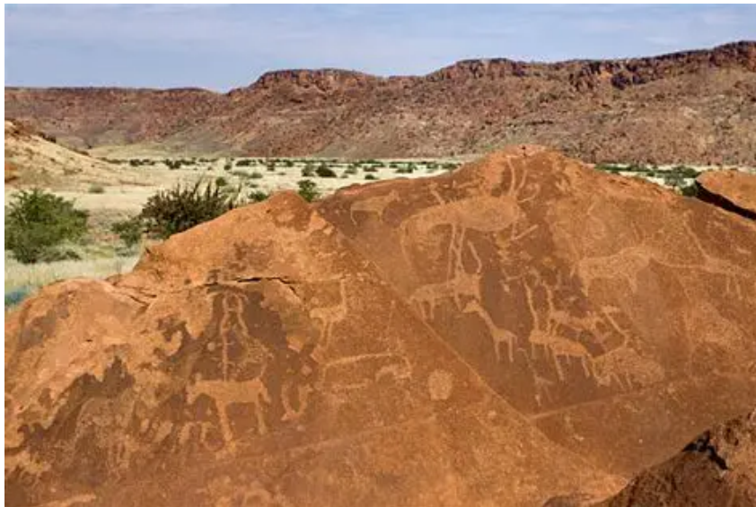
Namibian rock art at Twyfelfontein

A new collaborative project is linking heritage sites in South Africa, Namibia, and Botswana with European partners to foster cultural dialogue and shared learning. Sites such as Robben Island, Namibian rock art, and Botswana’s Okavango heritage landscapes are being connected with European museums and cultural institutions. This initiative positions tourism as cultural diplomacy, enabling communities to share histories, confront painful legacies, and celebrate common values. By encouraging exchanges between African and European heritage custodians, the project reinforces peace through mutual respect and understanding. Heritage tourism becomes not only a journey into the past, but also a pathway to reconciliation and global solidarity.