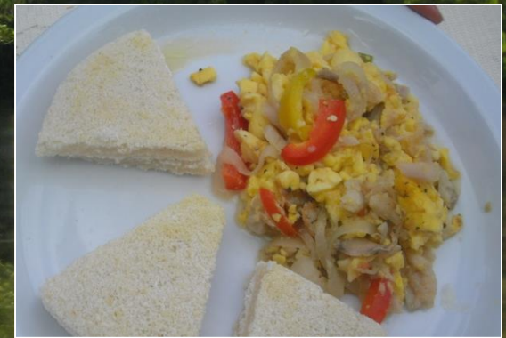
Bammy with Ackee and Saltfish