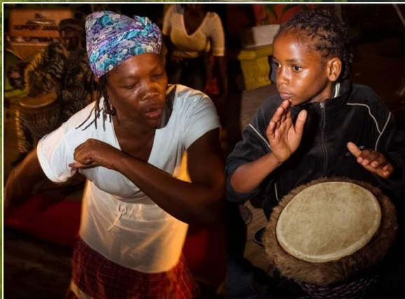
Resource Runkus Drummer and Dancer

US$85 per person, including tour experience, lunch, community host guide