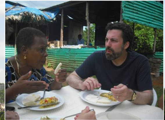
Lunch with Community Family