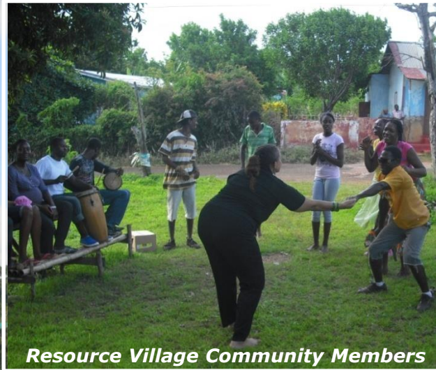
Resource Village Community Members

ENDORSED BY THE INTERNATIONAL INSTITUTE FOR PEACE THROUGH TOURISM (IIPT)