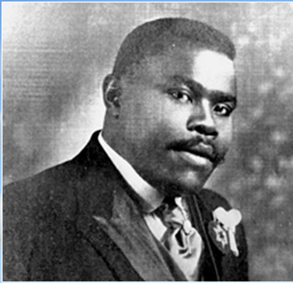
Rt. Excellent Marcus Mosiah Garvey