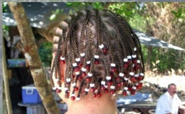
Vivian's Beauty Salon and Fashion House