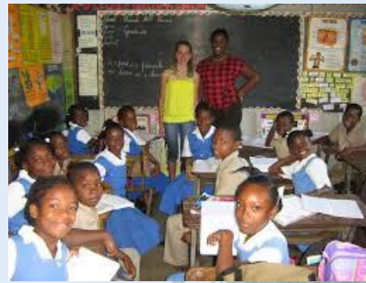
Church Hill Primary School

Bay is situated in Hanover and along with St. James and Westmoreland, they are found in the western side of Jamaica. These three parishes played vital roles in the prosperity of Britain, during the period of history when "sugar was king".