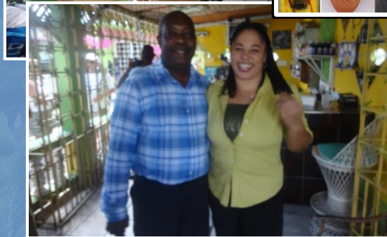
Local crafts and community host/guides