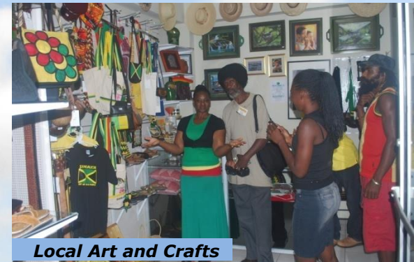
Local Art and Crafts