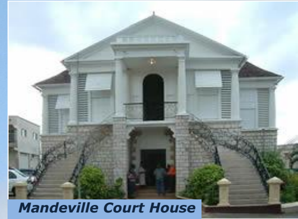
Mandeville Court House