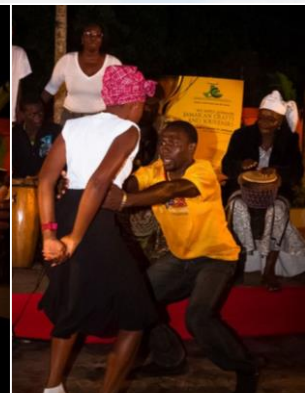
Resource Runkus Drummers and Dancers